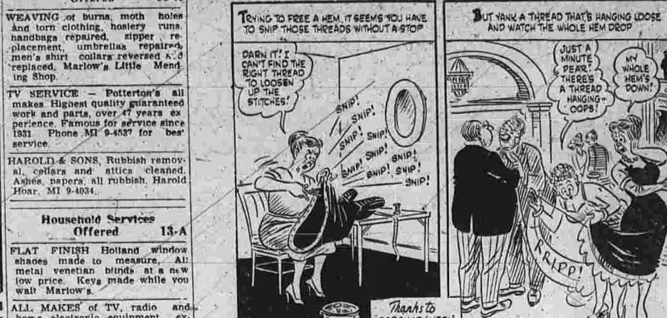
HERE OUGHTA BE A LAW BY FAGALY AND SHORIKEN